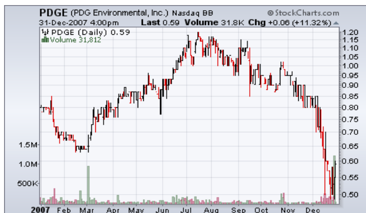
PDG Environmental, Inc. (OTCBB: PDGE)

Based on PDG Environmental, Inc. nine-month return and stated backlog, PDGE should close its January 31 fiscal year with revenue of $90 million to $100 million, a record year for the Pittsburgh based specialty contractor. (Cont. on page 3)